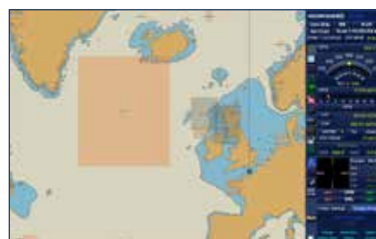
AIO (via C-Map CAES)